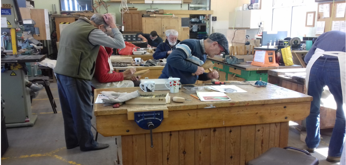
Some of our Woodcarvers in the workshop