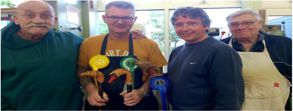
Our Walking Stick session users proudly displaying prizes for examples of work