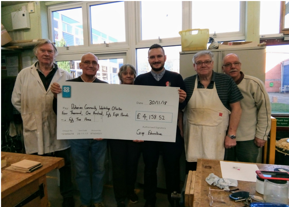
One of our major Supporter CO-OP Causes